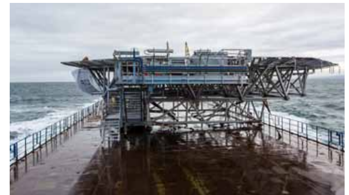
Helideck EC UK Sea transport