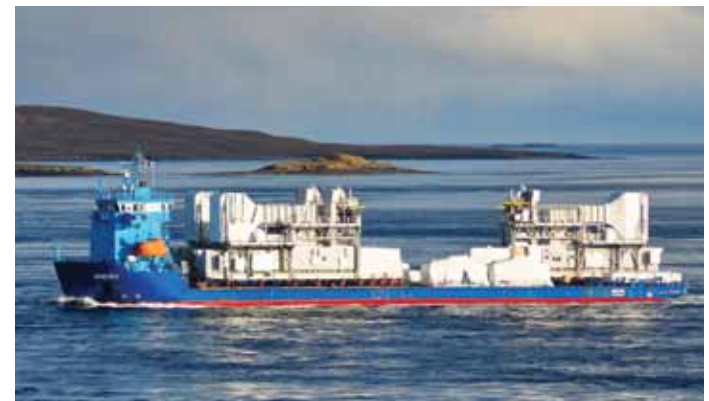
Offshore components Italy / UK Sea transport