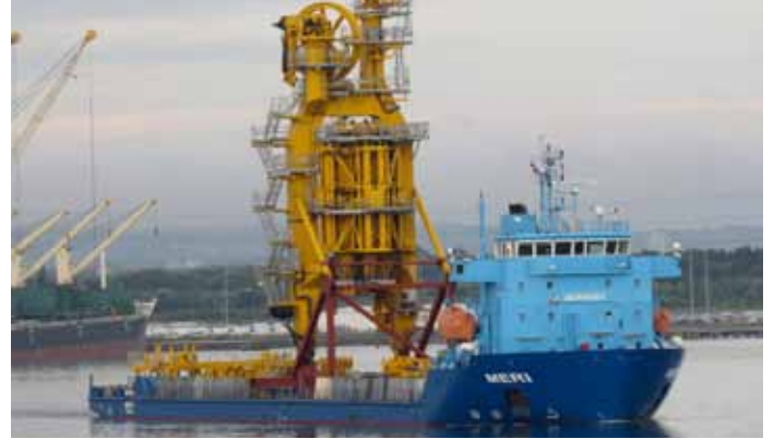
EB tower North Sea Sea transport