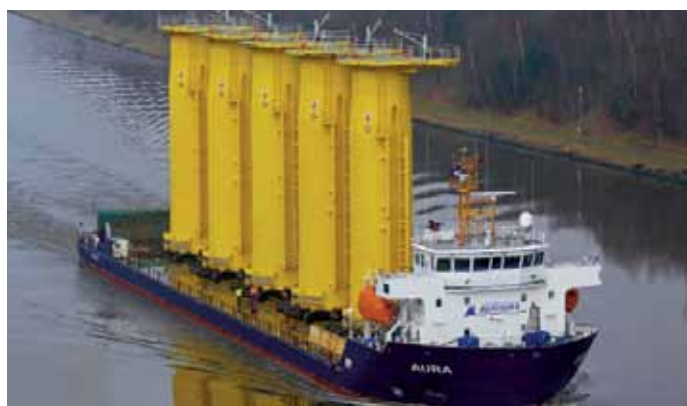
Windmill transition pieces Germany / UK Fabrication of transportation frames and sea transport

> CLIENT: DONG ENERGY / WALNEY II OFFSHORE WINDFARM