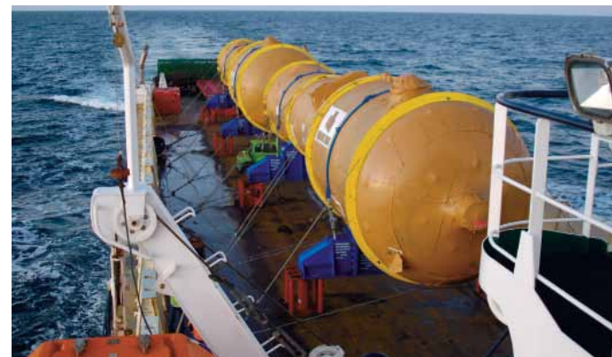
Power plant components Baltic Sea Sea transport