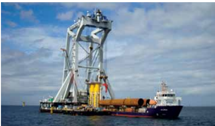
Windmill foundations Holland / Offshore site, UK East coast Sea transport

> CLIENT: DHL / SHERINGHAM SHOAL OFFSHORE WINDFARM