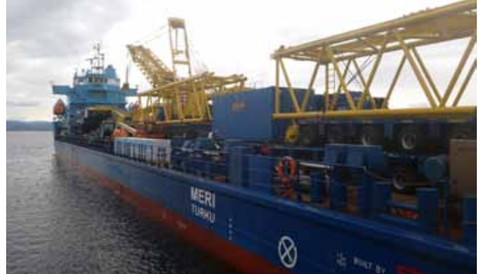
Mobile cranes Baltic Sea / North Sea Sea transport, engineering, sea fastening