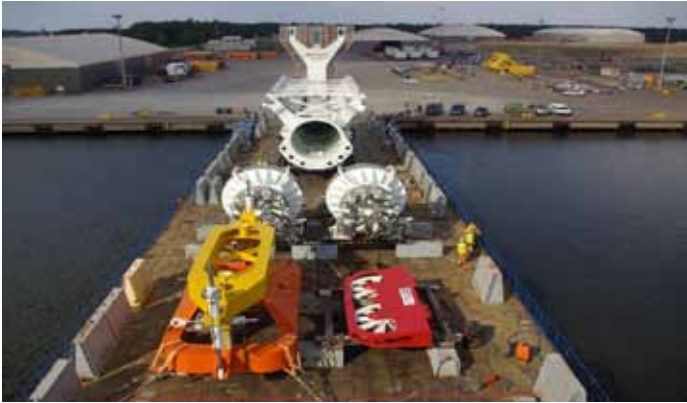
Asgard module launch/recovery system Finland / Denmark Sea transport