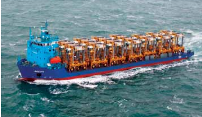
Harbour cranes Baltic Sea / North Sea Sea transport, engineering, sea fastening