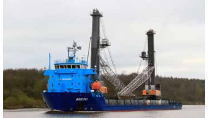
Mobile harbour cranes Baltic Sea / North Sea Transshipment & sea transport, engineering, sea fastening