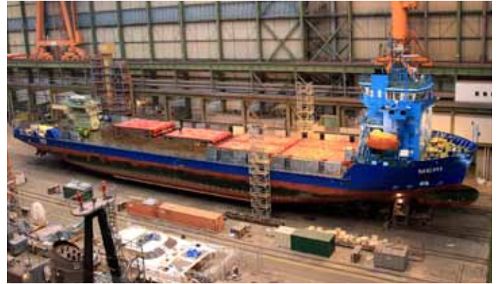
Engines and aux. Baltic Sea Sea transport & engineering