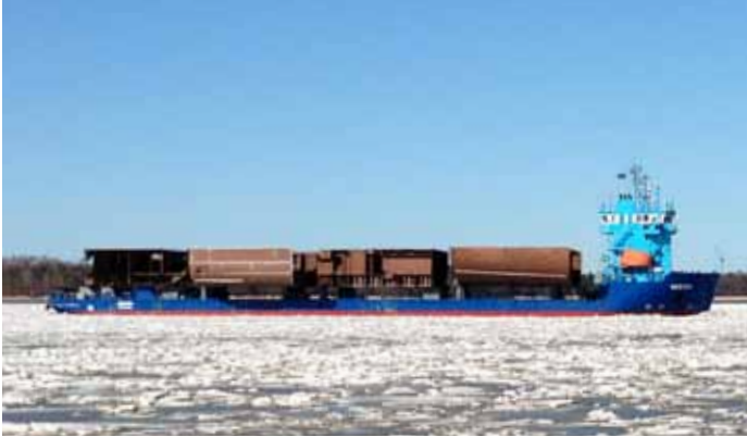
Ship sections and steel structures Baltic Sea shipyards to Finland Sea transport