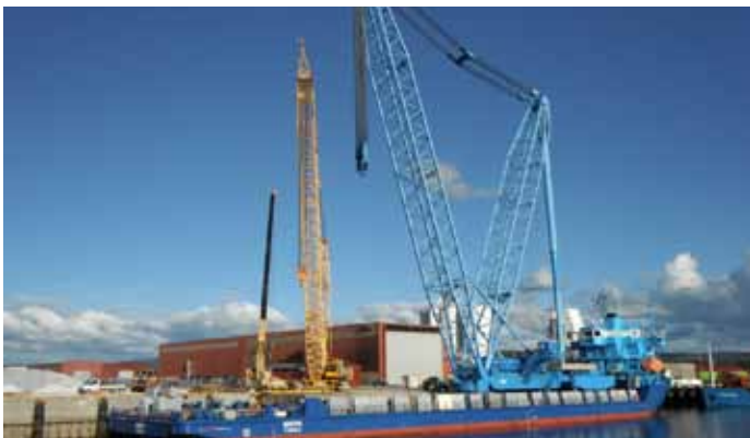
Heavy lift crane Norway Sea transport