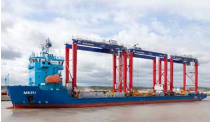
Rubber tyred container gantry cranes North Europe Sea transport, engineering, sea fastening