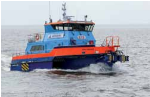
Our innovative trimaran crew transfer vessel "Wind Servant"

In recent years Meriaura has become a major transportation specialist within energy projects in North Europe and the Baltic Sea areas. We have successfully realized quite a number of transportations for oil and gas industry, offshore wind farms and nuclear and biofuel power plants.